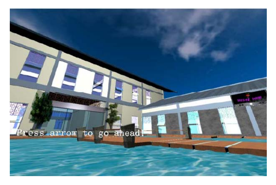
Figure 1: Virtual building roaming.

Virtual reality technology allows the artistry of a building to be displayed and highlighted. Space art here refers to the artistry from the use of space in and around a building. In the past, it was difficult to display space art in the design of a building. However, space art at the design stage can be displayed using virtual reality technology.